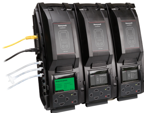
IntelliDoX automated instrument management system